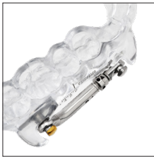
Round & Smaller Anterior/Posterior