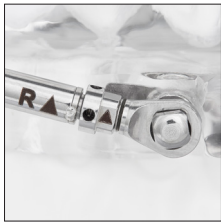
Nut Wrench & Pinhole Style