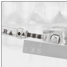
Laser Marked Visual Indicator on Arm and Splint for Advancement Confirmation